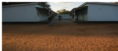
Health Clinic at Malipati