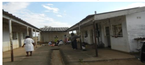
Health Clinic at Chitulipasi