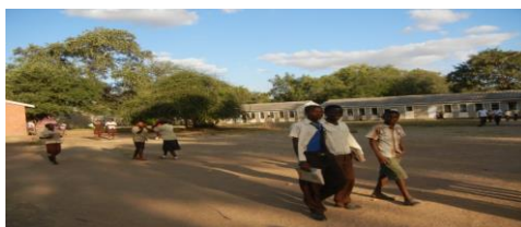
Primary School at Malipati

Preparation of Feasibility Report for Decentralized Photovoltaic Power Solutions For Rural Area in Masvingo Province for REA ,Zimbabwe