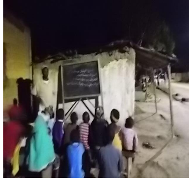
Street Lights installed in Koidu (Sierra Leone) under supervision of WAPCOS-Children attending night school under Solar Street Light.