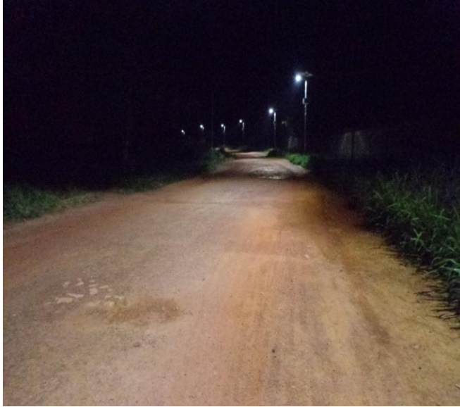
Dama Road (kenema District) after the installation of Solar Street Lights in Sierra Leone.