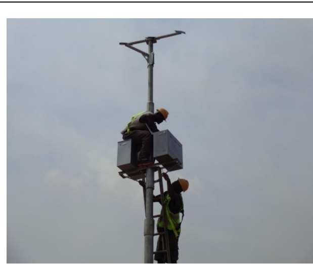
Installation of Solar Street Light is under progress in Sierra Leone under the supervision of WAPCOS