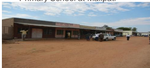
Chitulipasi Business Center