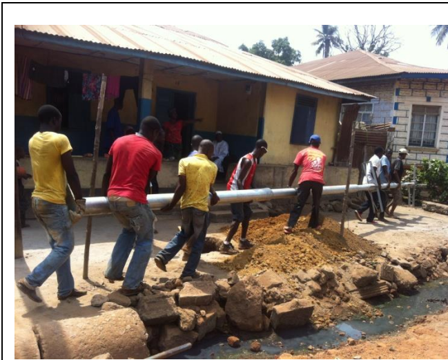
Installation of a Street Light is under progress under the supervision of WAPCOS in Mac-Robert Street, Makeni district, Sierra Leone